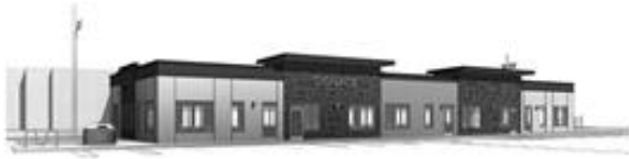
NORTHRIDGE BUSINESS CENTRE