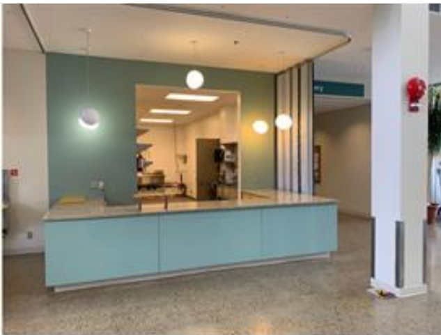
Facing unit from lobby (note: front renovated in 2023 to current set up)